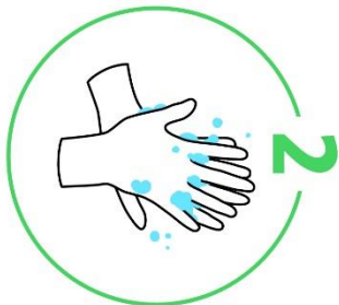
The backs of hands